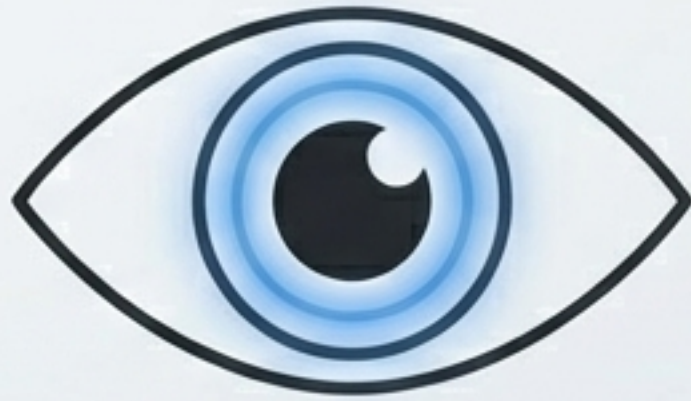
Pupillary Unrest (Hippus)