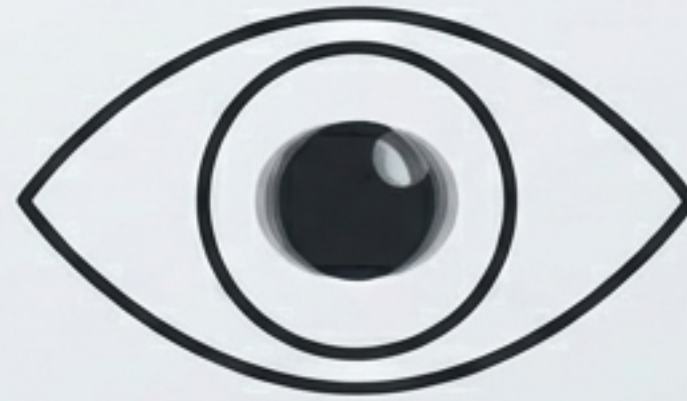
Gaze Instability (Nystagmus)