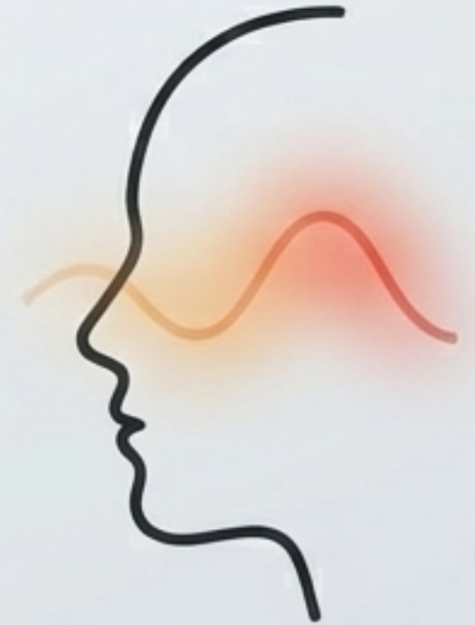
rPPG Blood Flow Surge